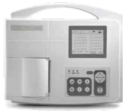
MennMove 300 Three-channel Electrocardiograph