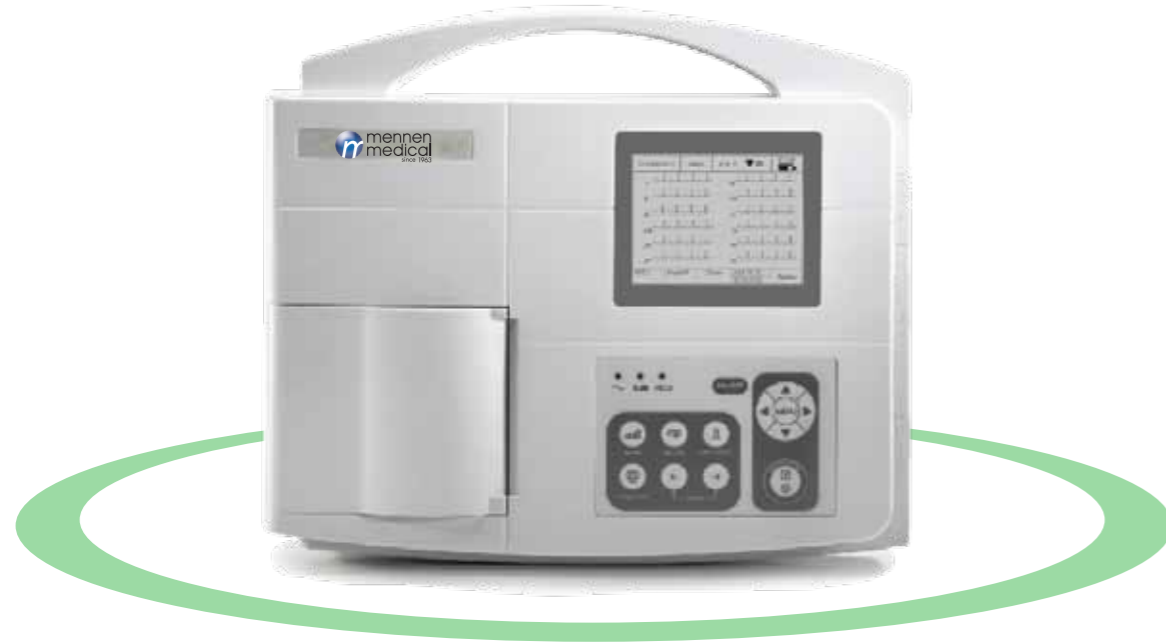
⏪ MennMove 300